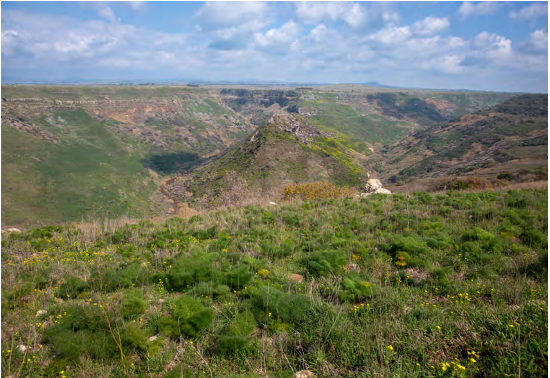
VIEW EAST: THE ACROPOLIS OF THE CAMEL-SHAPED FORTRESS OF GAMLA, SHOWING THE STEEP RAVINES ON THE NORTH, SOUTH, AND WEST SIDES. COMPARE WITH THE MAP ON PAGE 274.