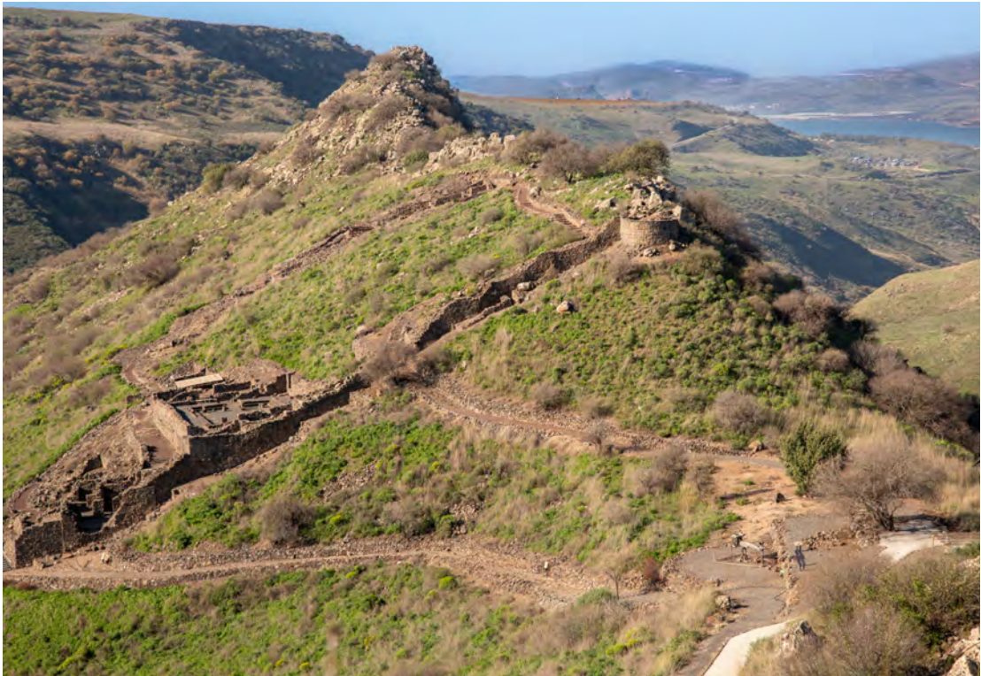
BELOW (VIEW WEST): THE NORTHERN WALL AND BREACH BELOW THE SYNAGOGUE (BOTTOM LEFT; SEE DETAIL PHOTO ON PAGE 280). ALSO VISIBLE IS THE SEA OF GALILEE (UPPER RIGHT).