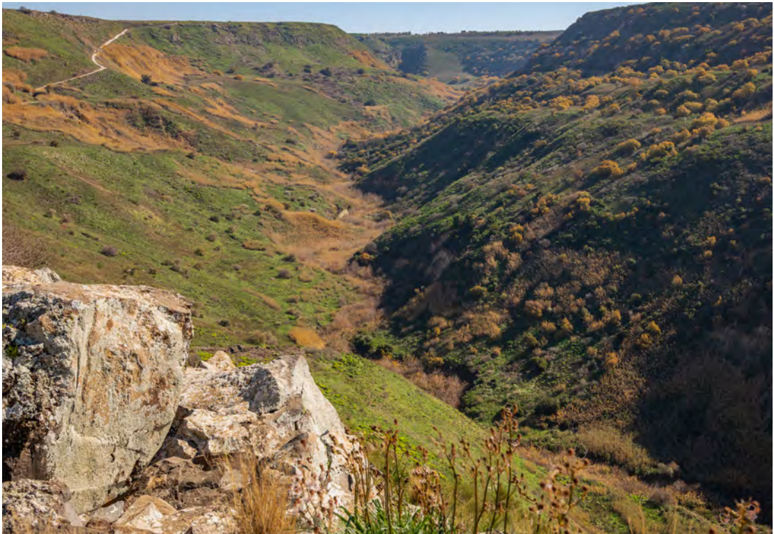
VIEW EAST: NAHAL DALIYOT FORMS THE CANYON ON THE SOUTH SIDE OF GAMLA. THIS PHOTO WAS TAKEN STANDING ON THE SOUTH SIDE. AT THE HEAD OF THE CANYON IS THE POPULAR DALIYOT RECREATIONAL CAMP.

After the citizens of Gamla raised the flag of rebellion against Rome, Herod Agrippa II laid siege to the town for seven months. When he failed to conquer the fort, the task was left to the Roman general Vespasian, who made two attempts. On the first, Jewish resistance was so intense that the Romans were forced to retreat with heavy losses. According to Josephus,