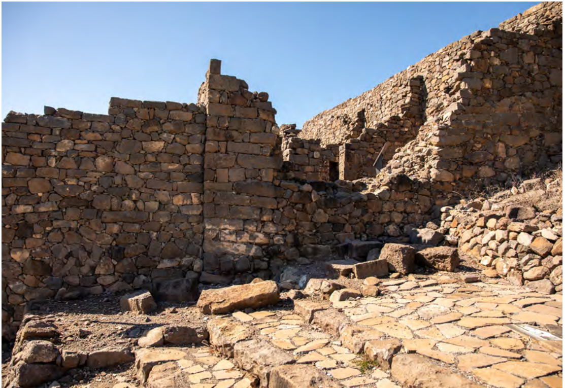
VIEW WEST: DETAIL OF THE BREACH IN THE DEFENSE WALL OF GAMLA. THE ROMANS BREACHED THE WALL, THEN FOUGHT THE JEWISH DEFENDERS UP THE HILL IN HAND-TO-HAND COMBAT.

means he will avenge those that have been destroyed, and punish those that have killed them. For myself I will endeavour, as I have now done, to go first before you against your enemies in every engagement, and to be the last that retires from it. 4